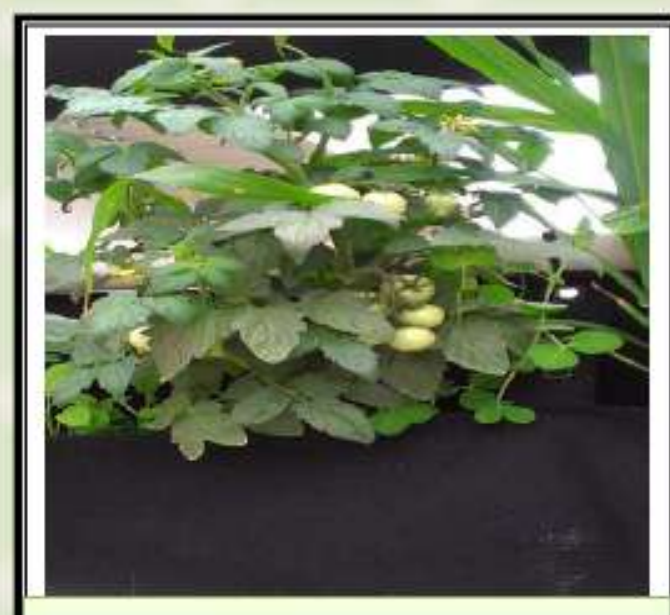
Wandering how the Waally Packets are daing? Check out our first tamataes fruiting!