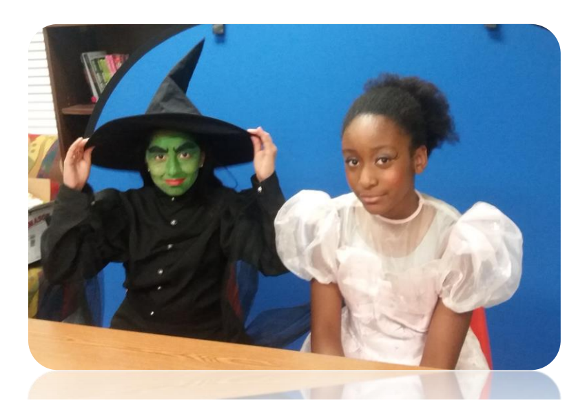
Two actresses from the upcoming "Wizard of OZ" production had a chance to appear on the daily morning announcements to promote their play.