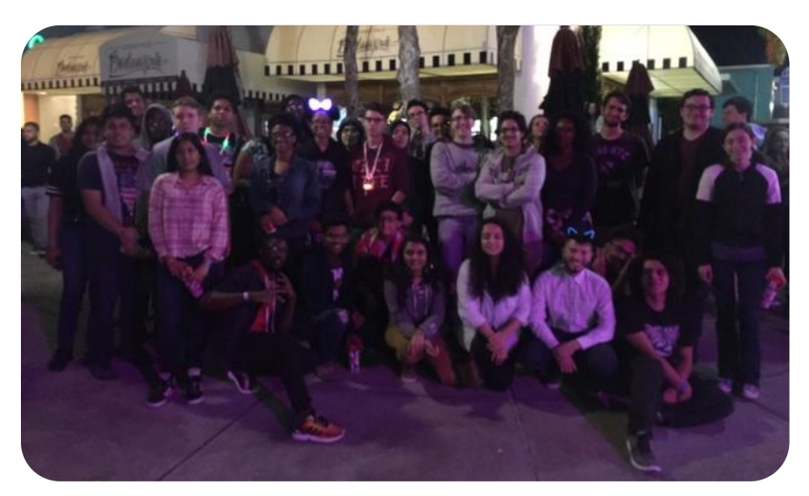
The Class of 2017 attending the annual senior celebration "Grad Bash at Universal Orlando"

Our students have been busy around school; take a look at what they have been up to.