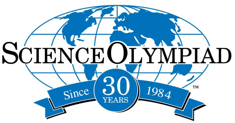
Exploring the World of Science