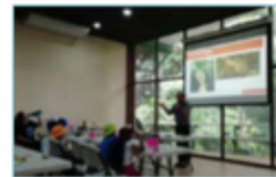
STEM SESSIONS IN THE RAINFOREST CLASSROOM